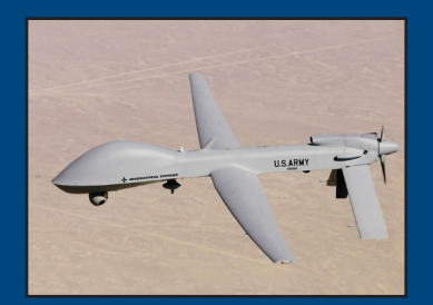
General Atomics (Gray Eagle)