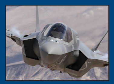
Joint Strike Fighter (F-35)