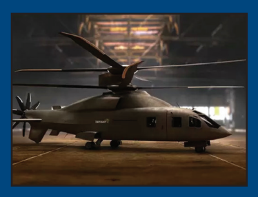
Collins Aerospace Perigon